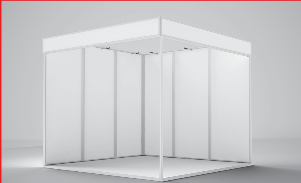
STANDARD SHELL SCHEME